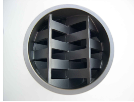
Mixing element LMXR (licensee of BAYER AG)