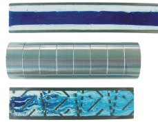
Mixing of epoxy resins in an empty pipe and in an mixer LMXR