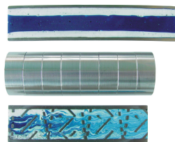
Mixing of epoxy resins in an empty pipe and in an mixer LMXR